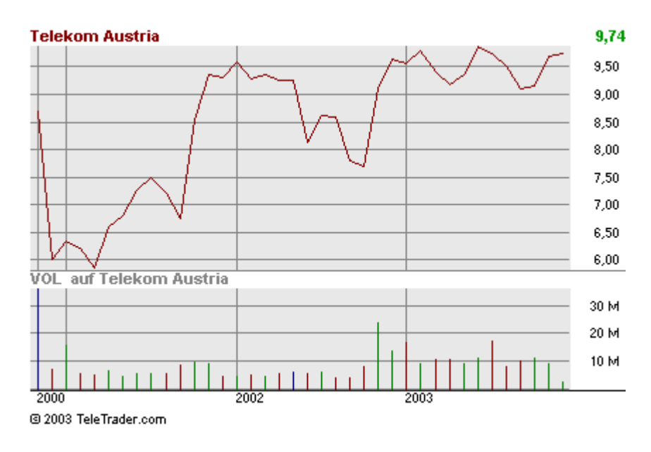
Figure 4.2: Performance of shares of Telekom Austria at the Vienna Stock Exchange

Source: Vienna Stock Exchange (2003). VOL means trade volume.