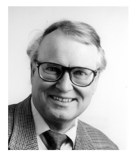
Figure 1. Assar Lindbeck