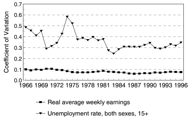
Figure A2. Regional Variation in Government Policies