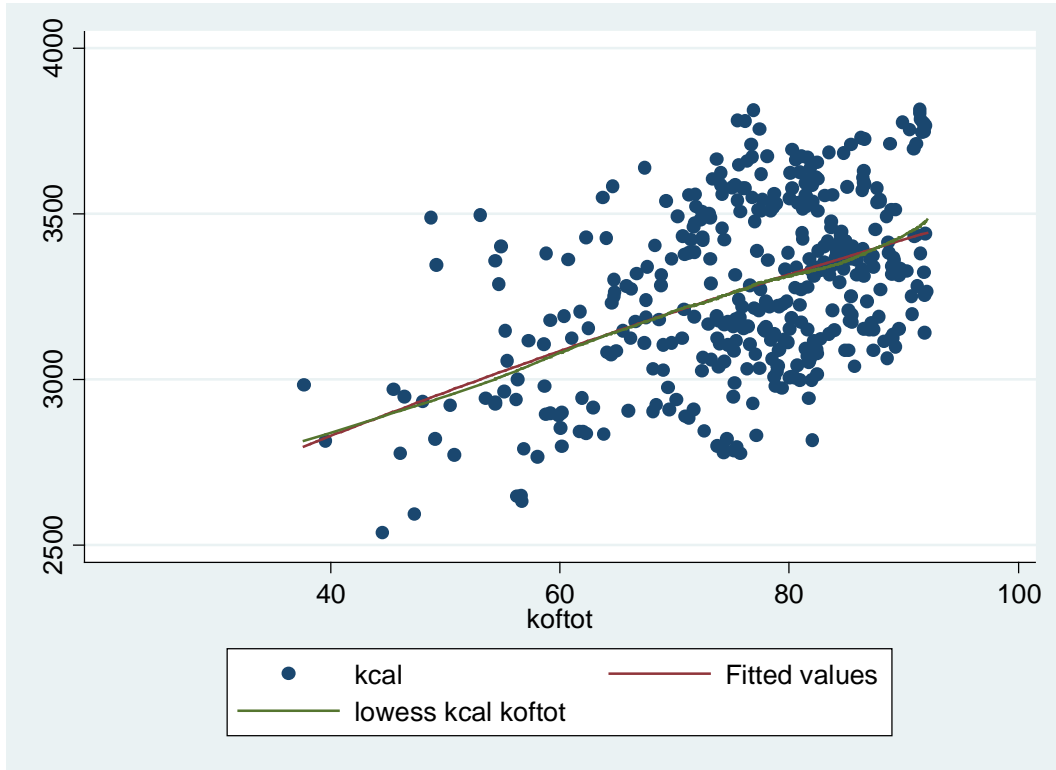
Figure 2. Variation of kilocalorie intake (adult population) and globalization

Note: Kilocalorie intake rate refers to the population’s daily per capita consumption of kilocalories, plotted against the variation in the KOF index of globalization on a 0–100 scale. A linear trend indicates the fitted least square value and the lower confidence interval.