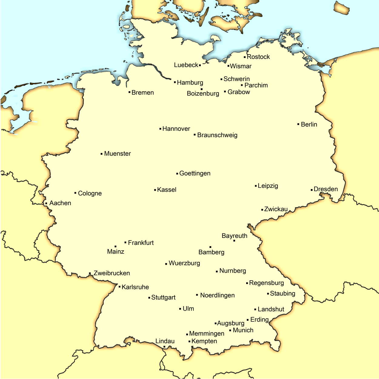
Figure 1: Sample Cities