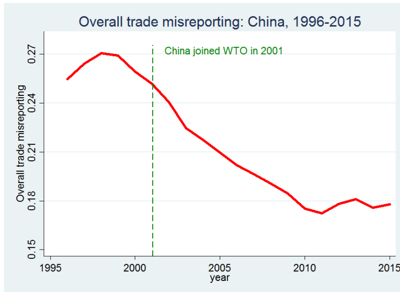
Figure 1: Trend of overall trade misreporting by China, 1996-2015