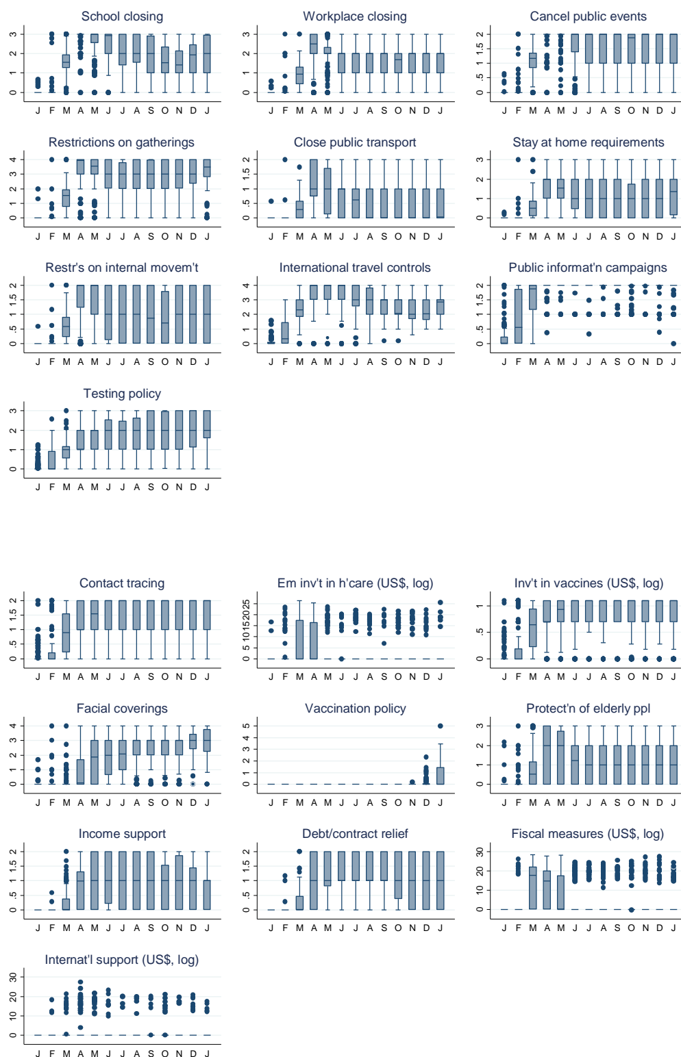
Figure 3: Government Response Measures to Covid-19

Notes: Data are monthly averages of daily values, January 2020 – January 2021. Raw data (last update: March 24, 2021) taken from the Oxford Covid-19 Government Response Tracker (OxCGRT).